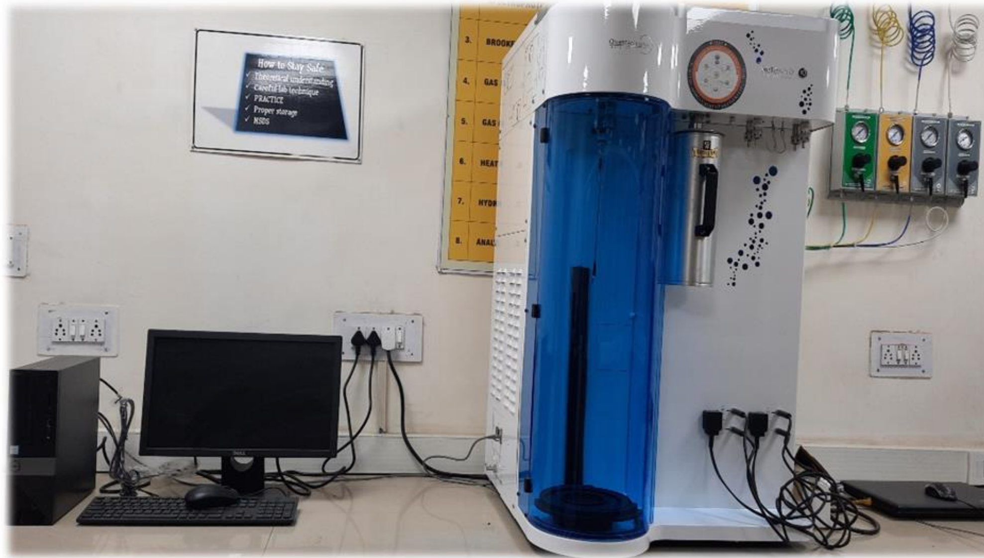
Surface Area & Pore Size Analyzer (Anton Paar)