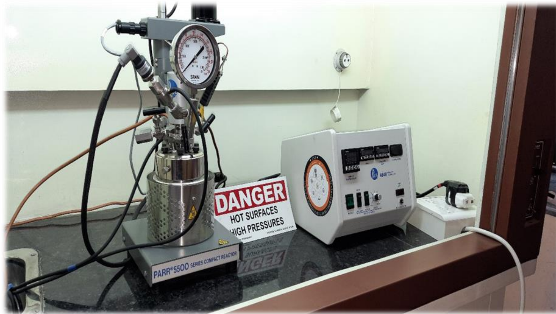
High Pressure Lab Reactor (Model 5500, Parr, USA)