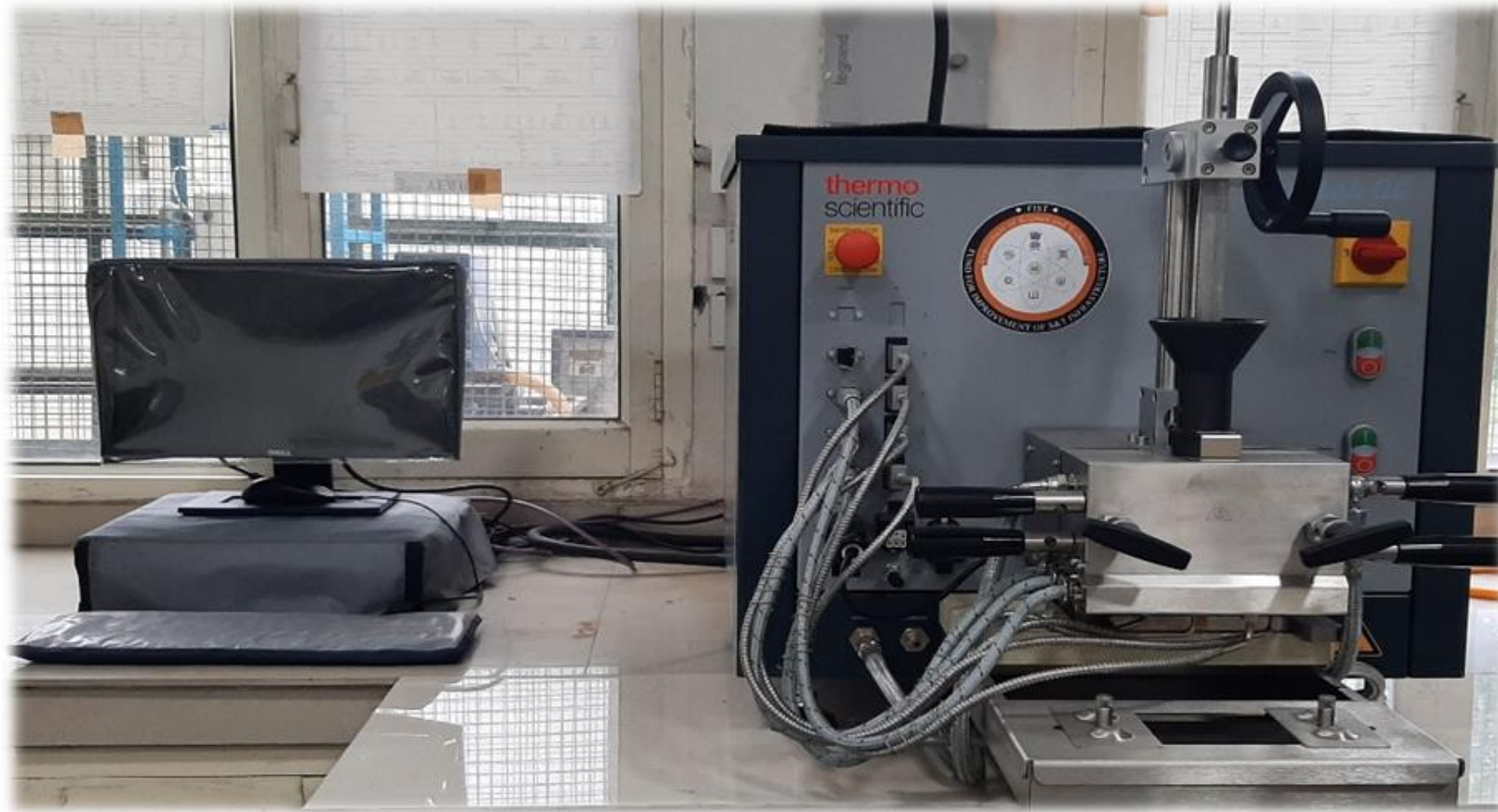
Haake Torque Rheometer (Polylab QC, Thermoelectron GMBH, Germany)