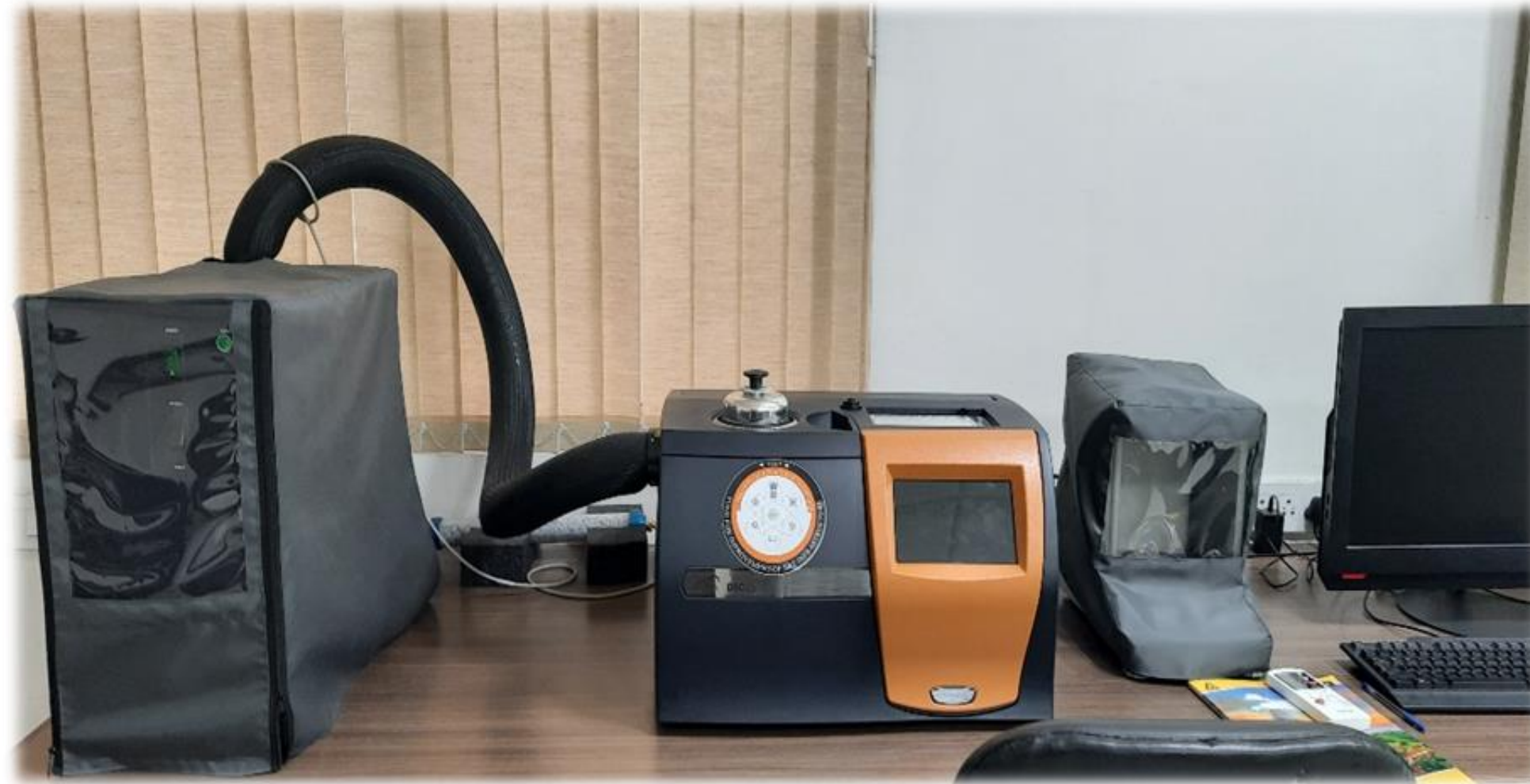
DSC Analyzer (Discovery DSC 25, Waters Ges MBH)